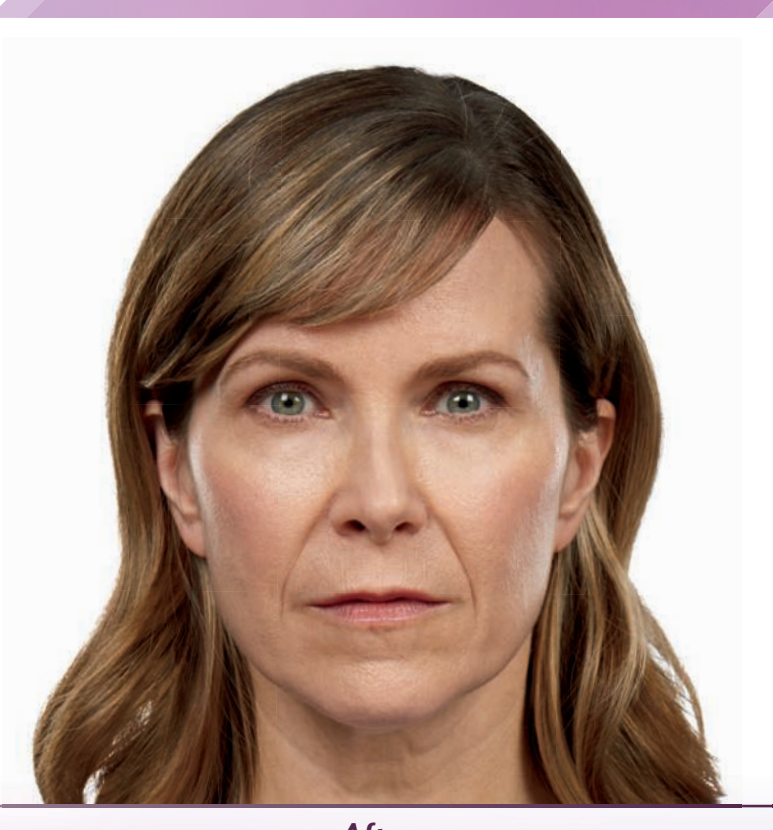
After 1 syringe of JUVÉDERM VOLUMA® XC

Actual patient. Results may vary. Unretouched photo taken I month after treatment with JUVÉDERM VOLUMA* XC. A total of 1.0 mL of JUVÉDERM VOLUMA® XC was injected into the cheek area.