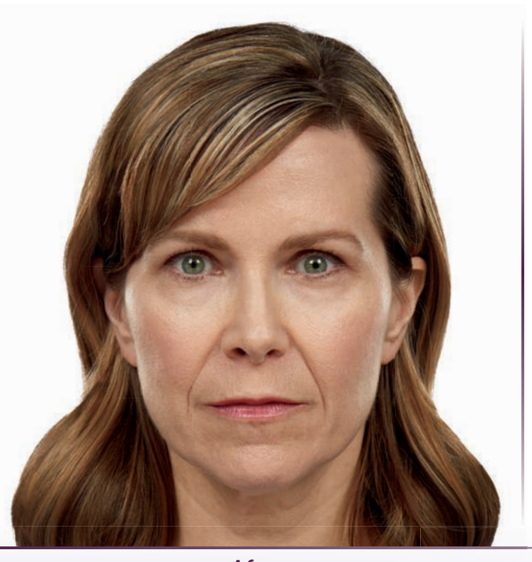
After optimal correction with JUVÉDERM VOLUMA® XC

Actual patient. Results may vary. Unretouched photo taken 1 month after second treatment with JUVÉDERM VOLUMA* XC. An additional 2.0 mL was injected into the cheek area for a total of 3.0 mL.