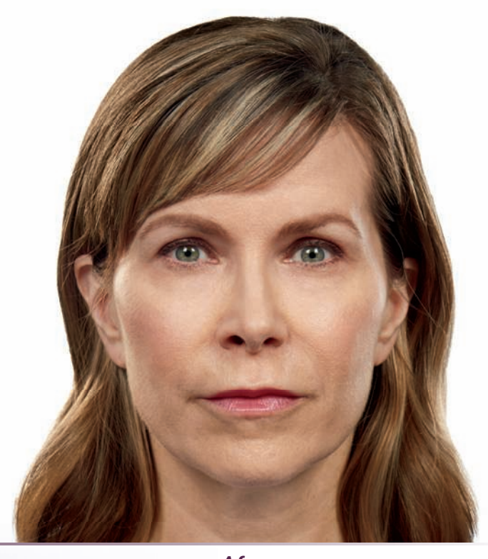
After smoothing lines with JUVÉDERM® XC and plumping lips with JUVÉDERM® Ultra XC

Please see Important Safety Information on the back.